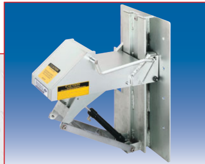
Available TRUCK-LOCK® Safety Systems