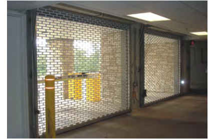
Sentury™ Rolling Grille

Security – The ability to close and lock. Perforated, slotted and solid configurations offer greater security. Visibility – The need for visual access of separated spaces. Open air, Lexan® or glass panels are available. Ventilation – Airflow between separated spaces. Design Aesthetics – Public areas demand a more visually pleasing product. Low Headroom Conditions – Ability to accommodate a coil at the head of the opening. Egress – A closed product opens to allow access to code required egress. Curved Openings Quiet Operation