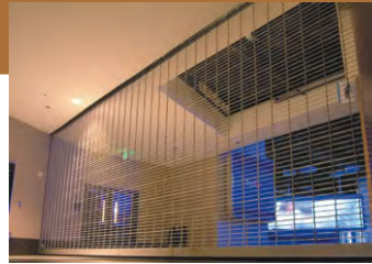
ACE® Emergency Response Grille

Airports Hospitals Government Arenas / Sport Complexes Schools and Universities Transportation Terminals