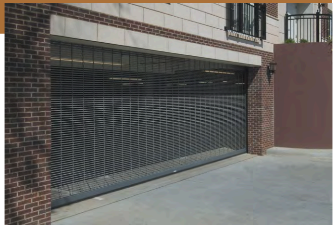
Cycle-Master® Straight Pattern Grille

Cycle Life – High Cycle units are expected to open/close more than 50 times a day and are defined as the required cycle quantity achievable in the lifetime of the product. Aesthetics of Opening – High traffic areas can demand a more aesthetically pleasing product. Visibility – The need for visual access of separated spaces. Ventilation – Airflow between separated spaces.