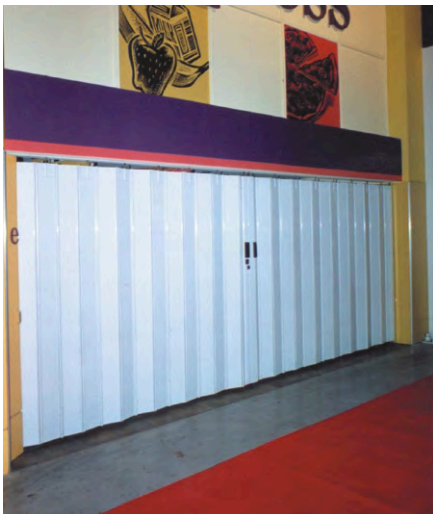
Vista Solid Grille